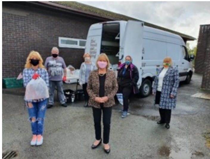
Supporting the community's efforts to tackle food poverty in the local area.