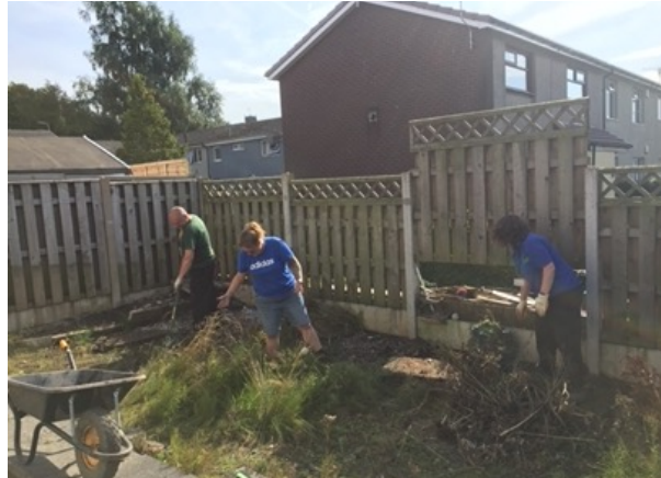
Improving the environment through Go Green, involving over 60 local people.