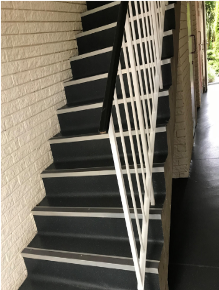
Internal Improvements in Church