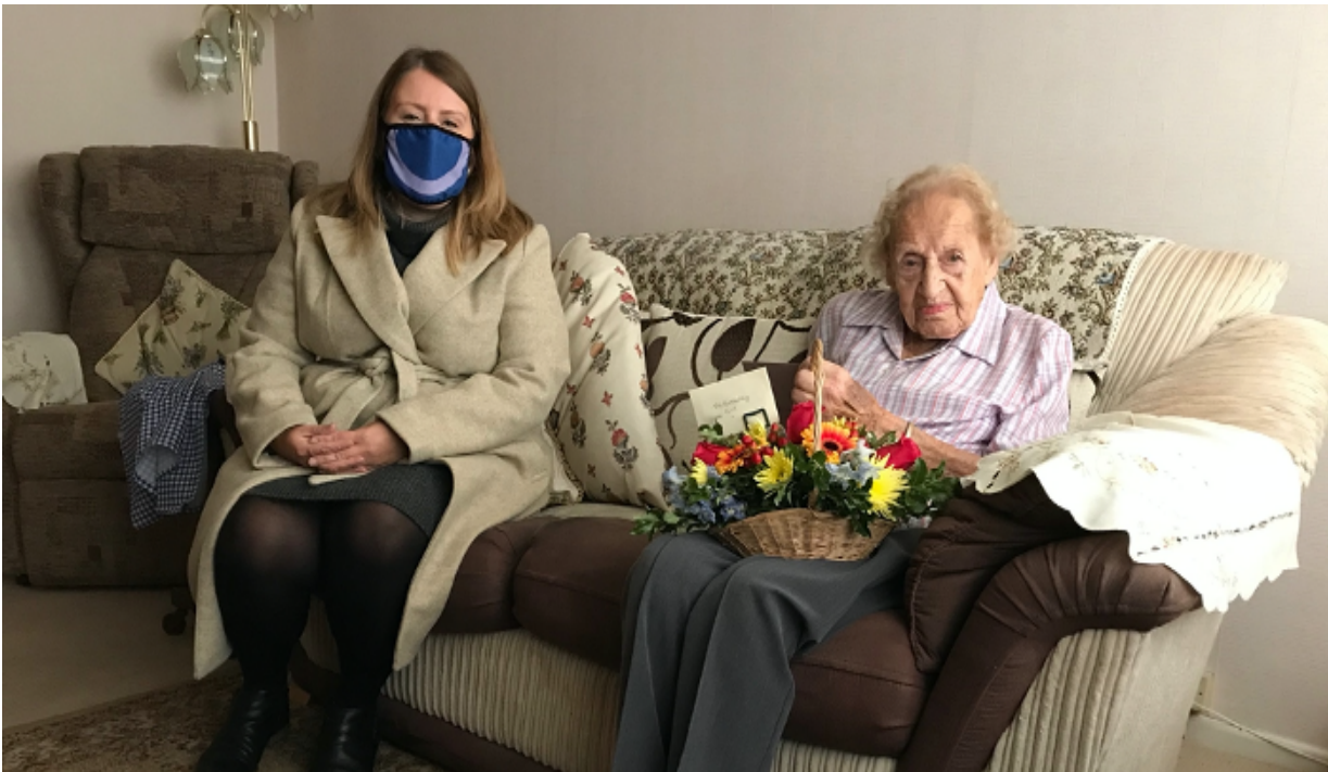
Being visible in our Huncoat & Milnshaw Neighbourhood