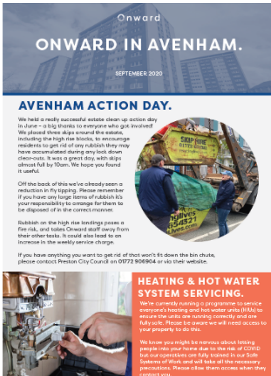
Preston Avenham Newsletter