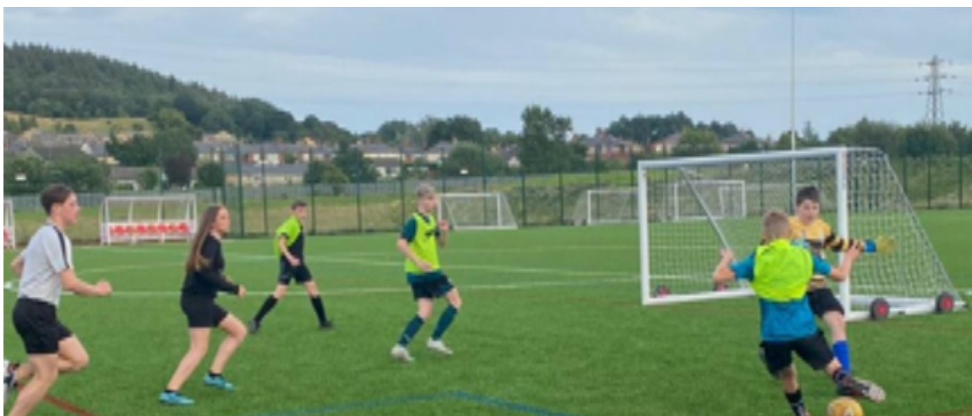
Summer Kicks – Central Accrington