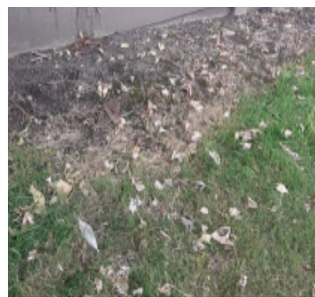
Addressing Fly tipping at Clyaton – le – Moors