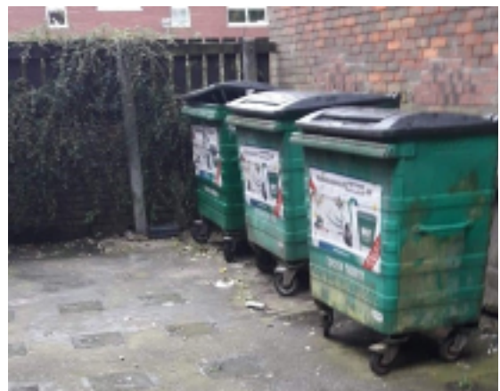
Addressing Fly tipping issues in Blackburn