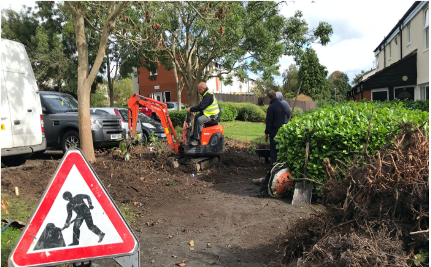
Significant investment improving the environment and grounds maintenance in Chorley